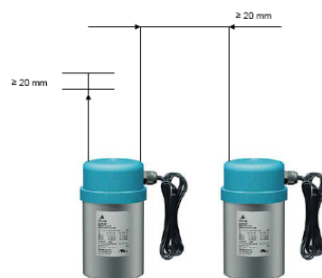
Figure 1: Minimum space over and between the capacitors.