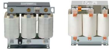
Fig. 2: Harmonic filter reactors

Additionally, be aware that capacitors without reactors could form a resonance circuit together with the power-line inductance (mainly the input transformer). It should be carefully checked that the resonant frequency of this LC combination in every switching state of the PFC system does not lead to resonant current amplification.