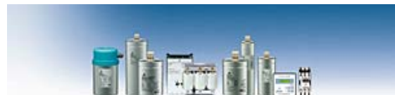
Fig. 7: PQS from EPCOS – all key components for PFC

EPCOS offers a complete range of products needed for successful power factor correction. All key components are carefully harmonized to each other – they are the basis for the power quality solutions strategy that EPCOS pursues to provide optimal products and services.