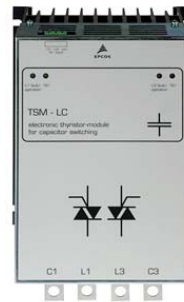
Fig. 5: Thyristor module TSM series

Modern dynamic PFC systems use thyristor modules to switch capacitor steps without any inrush current transients at all. They allow an almost unlimited number of switching operations without any stress on the capacitors or any negative impact on the power quality.