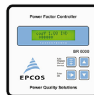
Fig. 6: PF-controller of the BR6000 series

To reduce the number of switching operations, it makes sense to use intelligent PF controllers . They can register the number of switching operations and the operation time of every step. Use this information when sequencing the steps to get a fast response with a minimum switching number and achieve even stress on the capacitors at the same time.