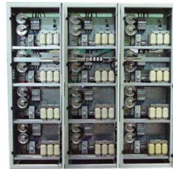
Fig. 1: Detuned PFC system

Also, measure how quickly the need for reactive power changes in order to determine suitable step sizes and switching time constants, and to decide if a dynamic system may be necessary. Please note that extraordinary events appearing during special load conditions such as voltage sags, transients or flicker might not be identified by a measurement of short duration. Only long-term monitoring can identify such power-line disturbances. According to the standards the measurement should be not less than one week.