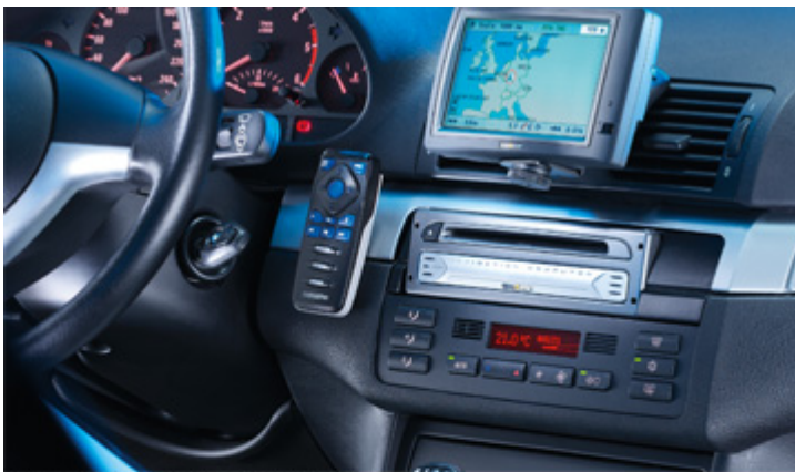
PROFILE CERAMIC PACKAGES

SAW filters for automotive applications are exposed to high mechanical and thermal stresses. To ensure that they operate reliably throughout the entire life of the vehicle, they are hermetically sealed in ceramic packages that can withstand temperatures from -40 to +125 °C.